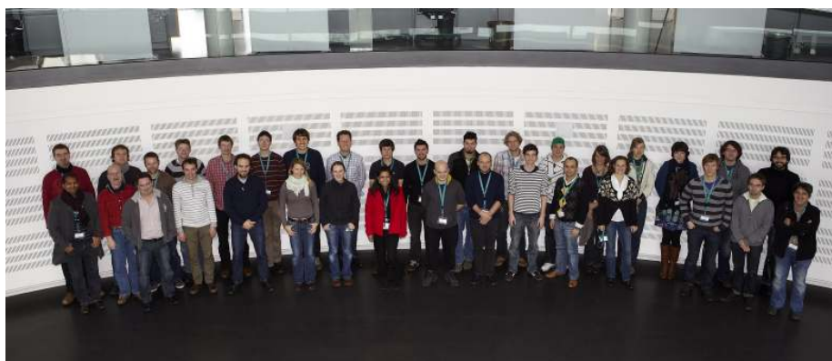
Figure 2: Delegates and organisers, EMBL, Heidelberg, 28 - 29 November 2011

On the 28 and 29 November, a 2 day version was taught at the EMBL in Heidelberg, at Wolfgang Huber's invitation (see figure 2).