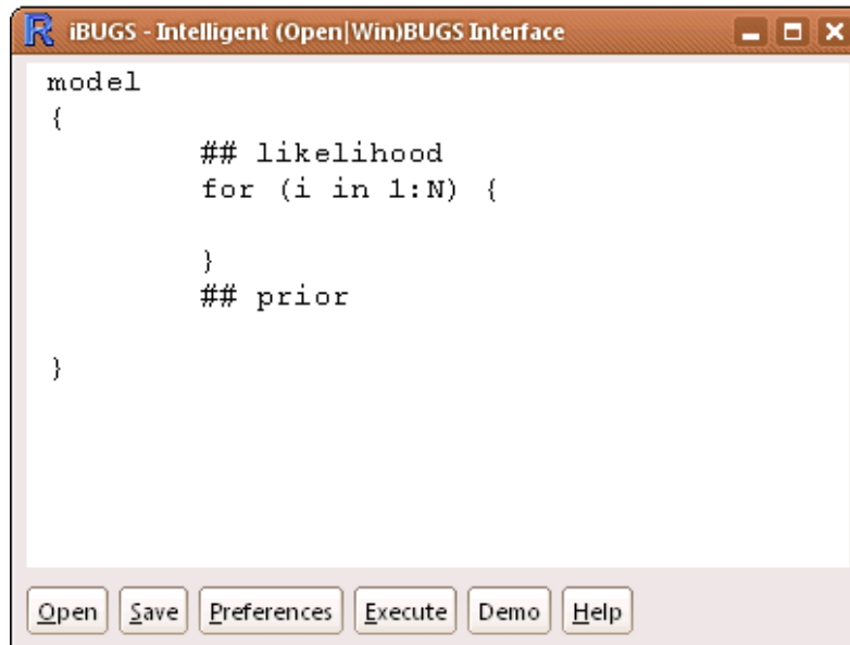
Figure 1: The main interface of iBUGS

the parameters (node) to monitor in the “Sampler Monitor Tool” panel, and the consequence was I got nothing after a long long waiting and began to regret clicking the “Update” menu too fast.