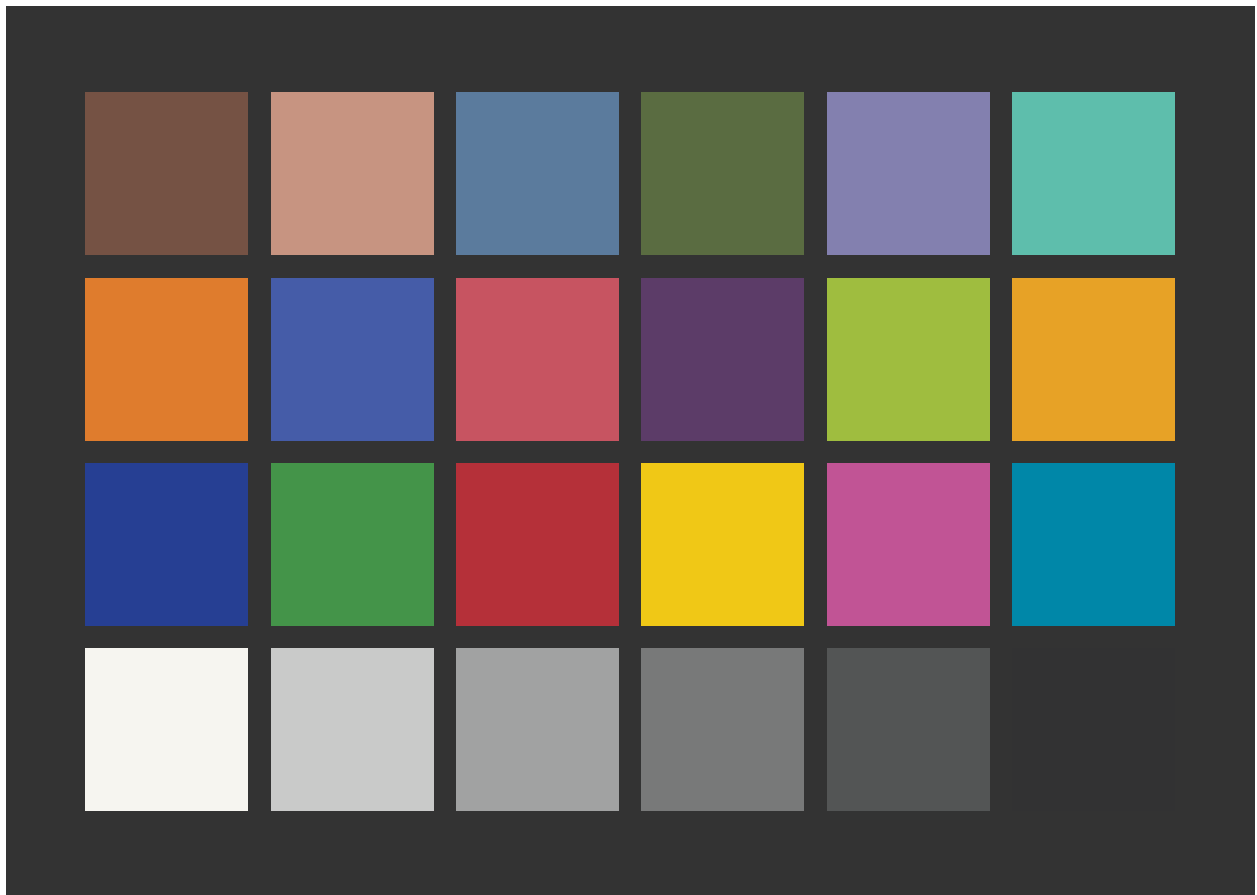
Figure 4: Rendering with Illuminant D50 and xyz1931.5nm, but then adapted to D65

The white-balance here is much improved. But it hard to compare colors in this figure with the ones way back in Figure 1. So combine the original D65 rendering in Figure 1 with this D50 rendering in Figure 4 by splitting each square into 2 triangles. We can do this by setting add=T in the second plot.